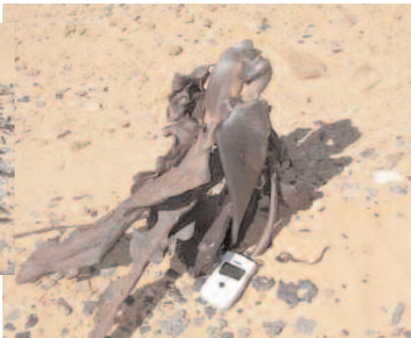
Vitrified sand (left photo) and scraps (right photo) at Gerboise bleue • November 16, 2007.

more than five years, from 1960 to 1966. That is a good illustration of General De Gaulle's remark: "Defense has no price."