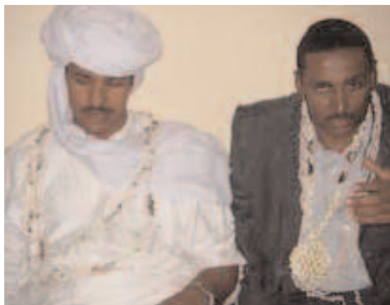
The sheik and the mayor of Reggane at the presentation of the Polynesian necklaces, November 17, 2007.