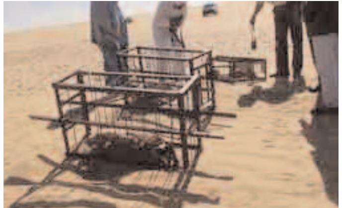
Cages (forgotten) containing cadavers of animals exposed during the first Gerboise blanche test on April 1st, 1960.

Probably impressed by their number at Gerboise bleue , I had not dared handle one. Here at Gerboise blanche , my curiosity won me over. Putting a piece in my hand, I realized that it was both very fragile and very light. So it is very likely that the winds have blown the vitrified sand to distances difficult to calculate. Ignorant of the risks, a craftsman or a maker of souvenirs could very easily inhale or swallow radioactive black powder while cutting or polishing a fragment.