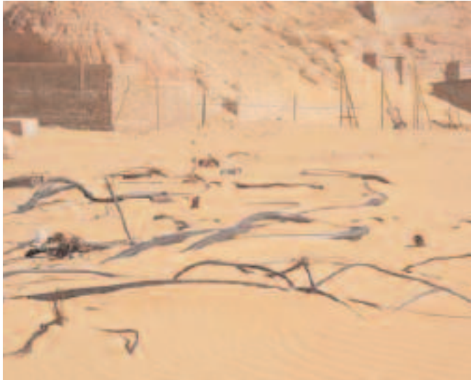
State of the CEA area, Reggane • November 17, 2007.

“gardener”. As if it were an echo, I hear the same things said about the poisoning of fish —the only protein source— at Mangareva.