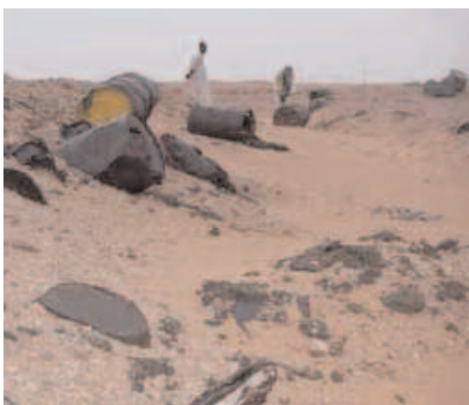
A trench near Reggane plateau • November 15, 2007.

Overall, the platform is a desolate sight. Despite the ochre desert sand that inexorably covers and then uncovers the remains —electric cables, scrap metal, tubes, and water pipes are strewn over several hectares of earth— I find here the same tangles of abandoned cable found on the beaches of the Hao atoll, another scene of the post-nuclear disaster, the latter in Polynesia. It is difficult to attribute a “paternity” to this open-air trashcan; evidently, the platform installations were not dismantled according to the rules at the time of the French departure in 1966. But the anarchical destructions and salvages were apparently carried out by Algerian military units that occupied the sites afterward, as numerous graffiti indicate.