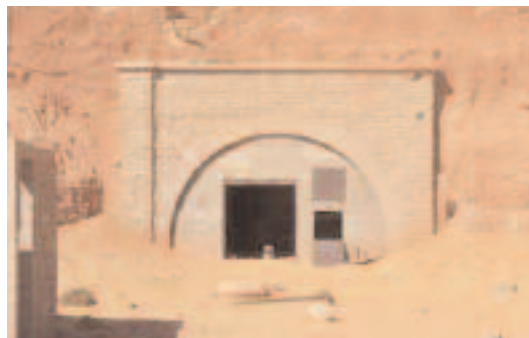
Entrance of a tunnel in the CEA area • Reggane. November 17, 2007.

Today, civilian airlines do not go directly to Reggane. One must first travel to the small town of Adrar, 1200 kilometers south of Algiers, and then take the asphalt highway which goes uninterrupted over 160 kilometers to Reggane. Between Adrar and Reggane, palm groves, true oases of green in the immensity of the ochre sand, succeed each other. All along the way, one is aware of the