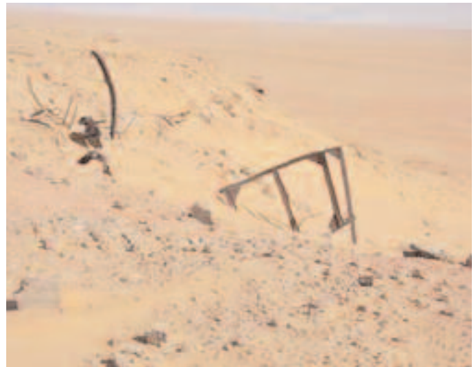
Hammoudia ruin with a view of the desert • November 16, 2007.

The approach from the route below, leading to the entrance of the CSEM, reveals a flagrant lack of respect for the environment. Hundreds of metal barrels, probably for asphalt, have been abandoned there, probably since the 1960s, in a large space surrounded merely by barbed wire. Continuing on, we could imagine, from this desolate spectacle, what we were going to find.